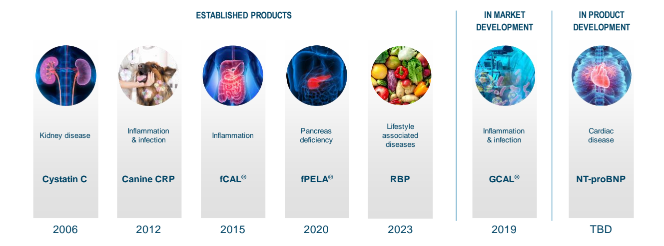
Illustration of product categories